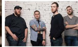
County Line Band