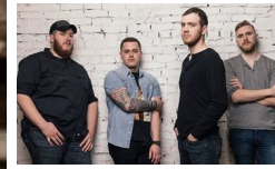
County Line Band